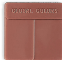
Iron Red 75882