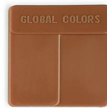
Iron Red 75832