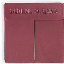
Met Red 80805